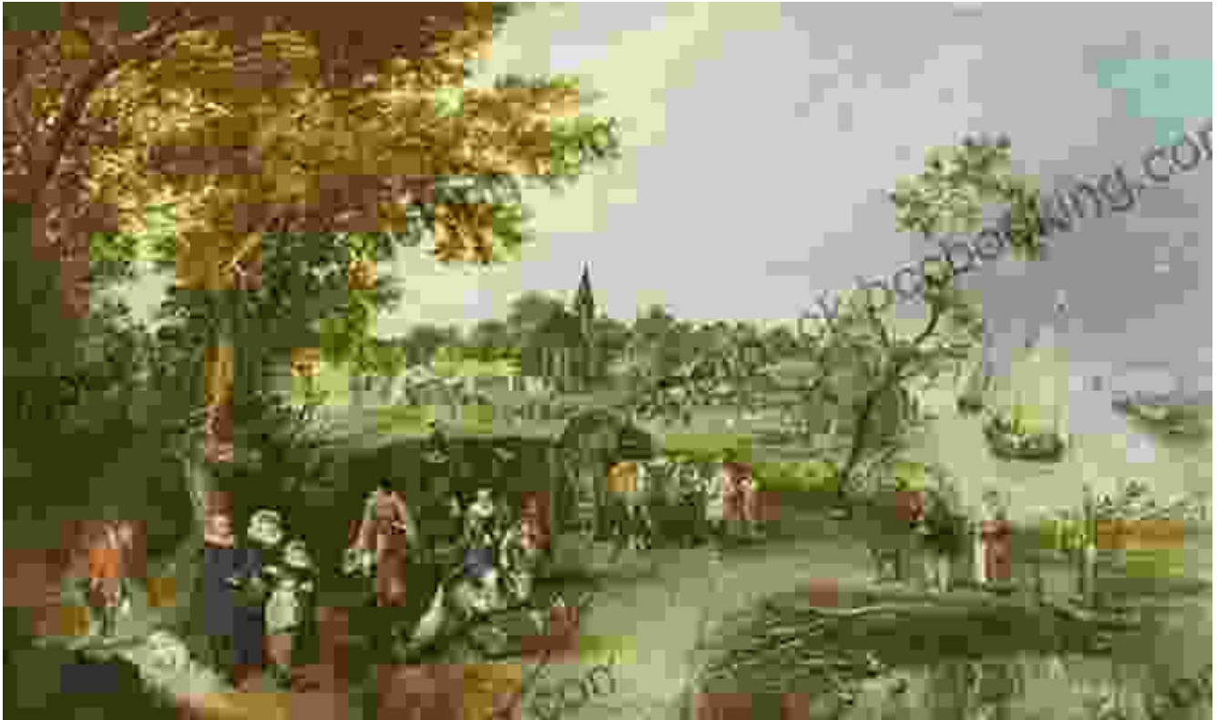
Landscape with a Cottage and Trees, c. 1630-1635