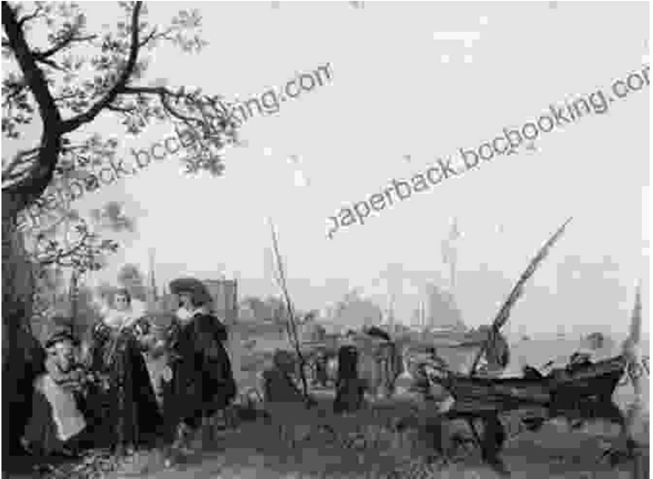
River Landscape with a Ferry, c. 1625-1630