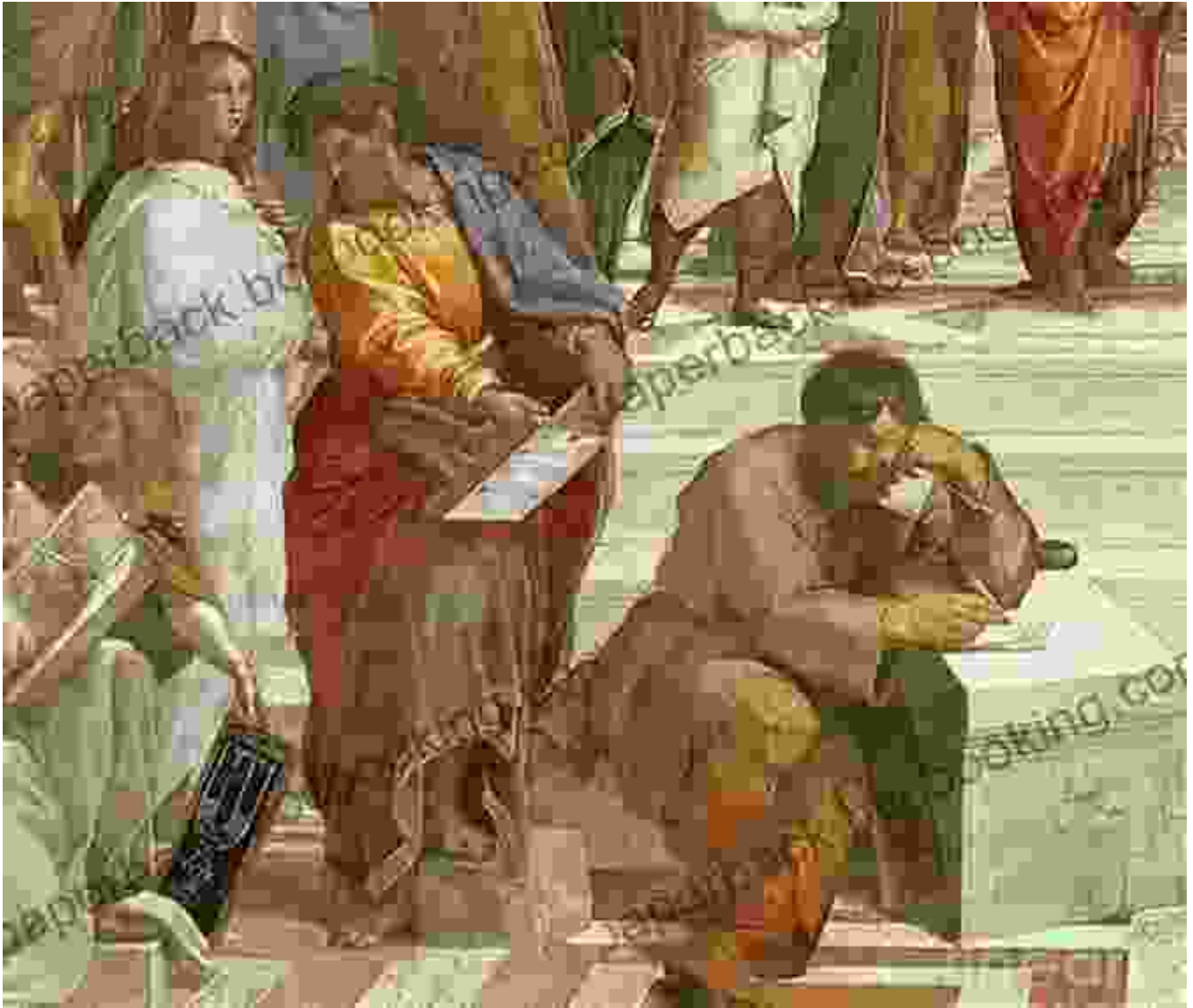
Raphael, 'School of Athens' (detail), fresco, 1509-1511, Vatican, Rome

"Raphael was the perfect artist. His works are full of beauty, harmony, and grace."