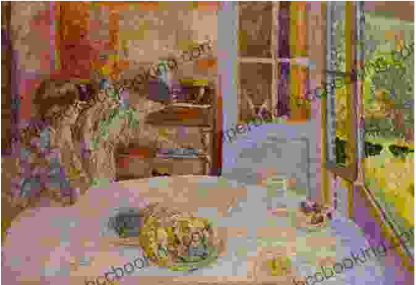
Pierre Bonnard, The Dining Room, 1925-1930.